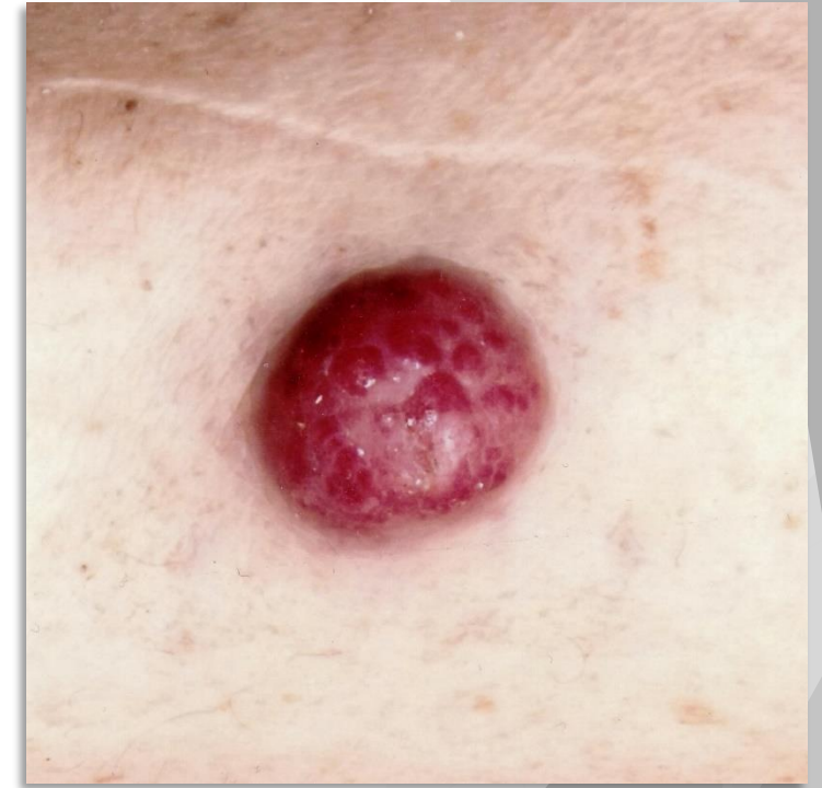
MCPyV: Merkel cell carcinoma