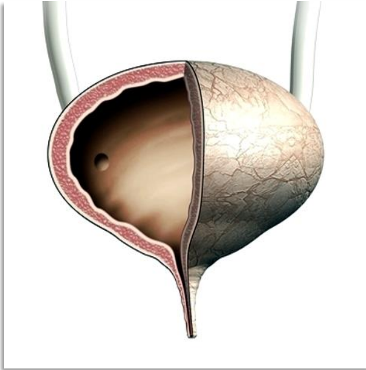
BK virus: Hemorrhagic cystitis

Associated with immunocompromised people